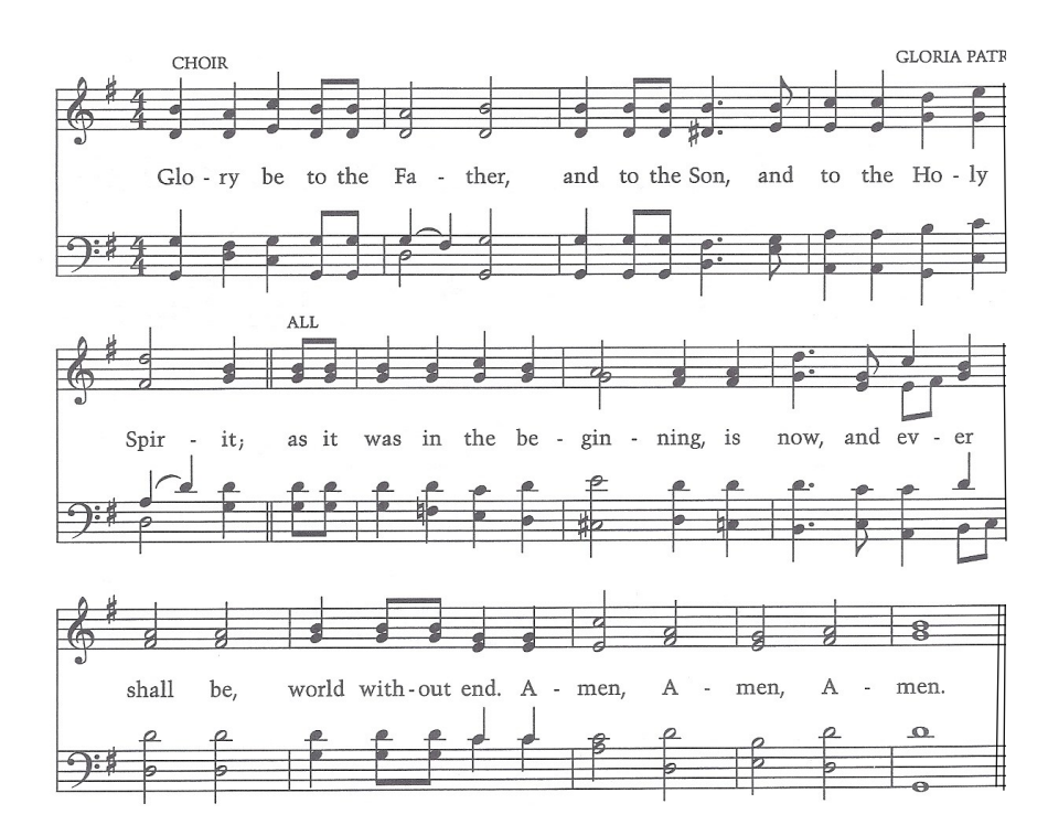
Adapted from the 1969 Hymnal of the Moravian Church, with the permission of the Interprovincial Board of Communication, Moravian Church in North America. ©1969, Moravian Church in America Northern and Southern Provinces